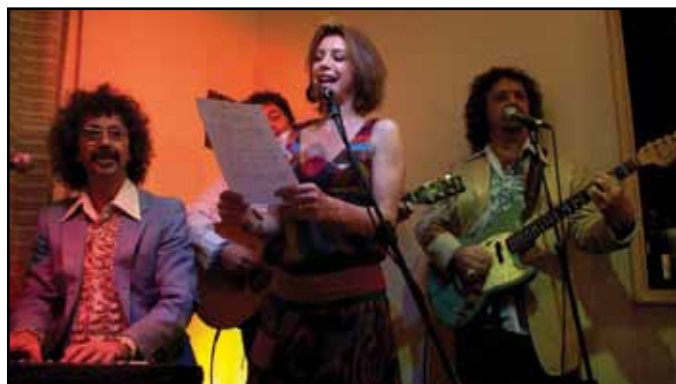
A scene from the Italian film Days and Clouds , the InfoZone's independent film for the month of January.

Well-to-do, sophisticated couple, Elsa and Michele, have a 20 year-old daughter, Alice, and enough money for Elsa to leave her job and fulfill an old dream of studying art history in Days and Clouds , the InfoZone's independent film for January, scheduled to be shown at 7 p.m. on Saturday, Jan. 17. After Elsa graduates, however, their lives change. Michele confesses he hasn't worked in two months and was fired by the company he founded years ago. Elsa overcomes her initial shock by pouring extra energy into facing the crisis while Michele, exhausted by an unsuccessful job hunt, lets himself go, alternating between vivacity and apathy. The growing distance between them eventually leads to a break-up. Only when they are apart do they realize that they risk losing their most precious possession: the love that binds them. Days and Clouds is an award-winning drama from Italy. The film is not rated and is in Italian with English subtitles.