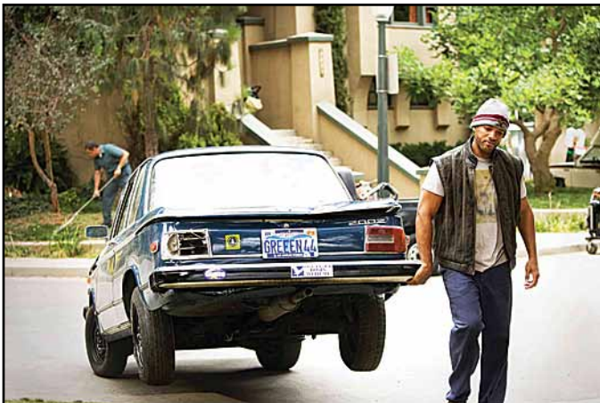
Will Smith stars in Hancock , the January Teen Movie scheduled to be shown in the InfoZone at 7 p.m. on .

Based on Marjane Satrapi's autobiographical graphic novel, this Oscar nominee for Best Animated Feature Film also features the vocal talents of Catherine Deneuve and Simon Abkarian.