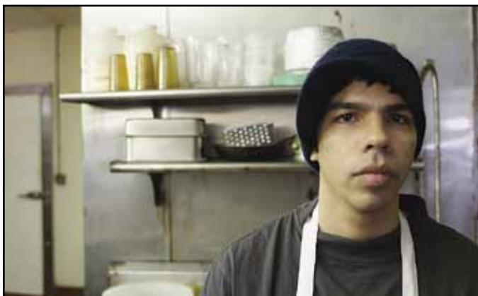
The February indie film, produced in America, is Choking Man .