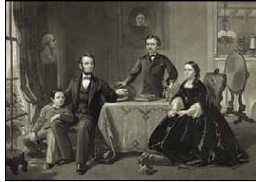
A portrait of the Lincoln family.